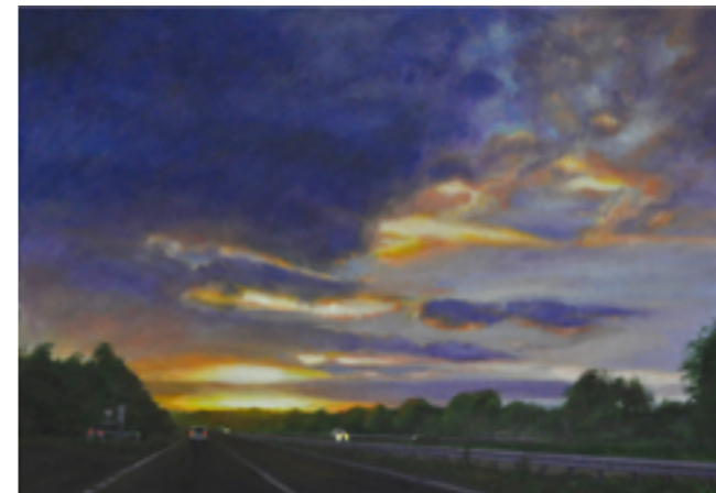
The image above is entitled "Nearly Home".